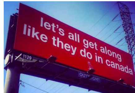
In 2017, Toronto Rap artist Drake installed this billboard in LA. It sparked a global conversation.

Our second trademark is process expertise , such as soliciting input, rallying diverse perspectives, building teams, resolving conflicts and leveraging complementary abilities. Process allows people to interact effectively and democratically in order to reach sound and satisfying decisions. It’s about reframing issues and pulling themes until a common platform emerges, ensuring discussions don’t become polarized or personal as well as using solid and democratic methods for consulting, problem-solving and decision-making.