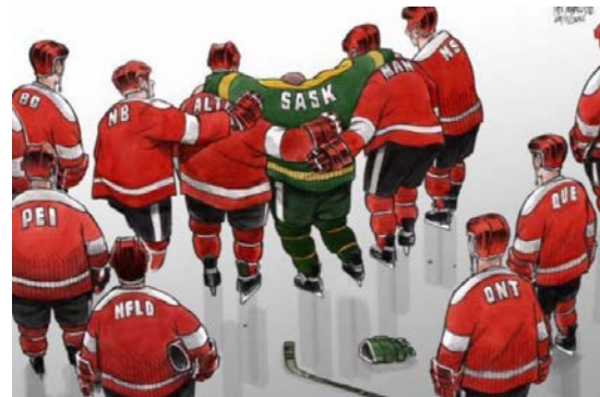
Cartoon by Bruce MacKinnon, retrieved from: https://globalnews.ca/news/4137694/humboldt-broncos-bus-crash-cartoon/

For instance, think of how Canadians rallied to help during the 2013 Calgary Floods, the 2016 Fort McMurray Fires, and in the aftermath of the devastating 2018 Broncos’ bus crash in Saskatchewan. Not only did the victims demonstrate exceptional courage and resilience, the general public went out of its way to provide support and help. In many cases, these tragedies built and reinforced community bonds.